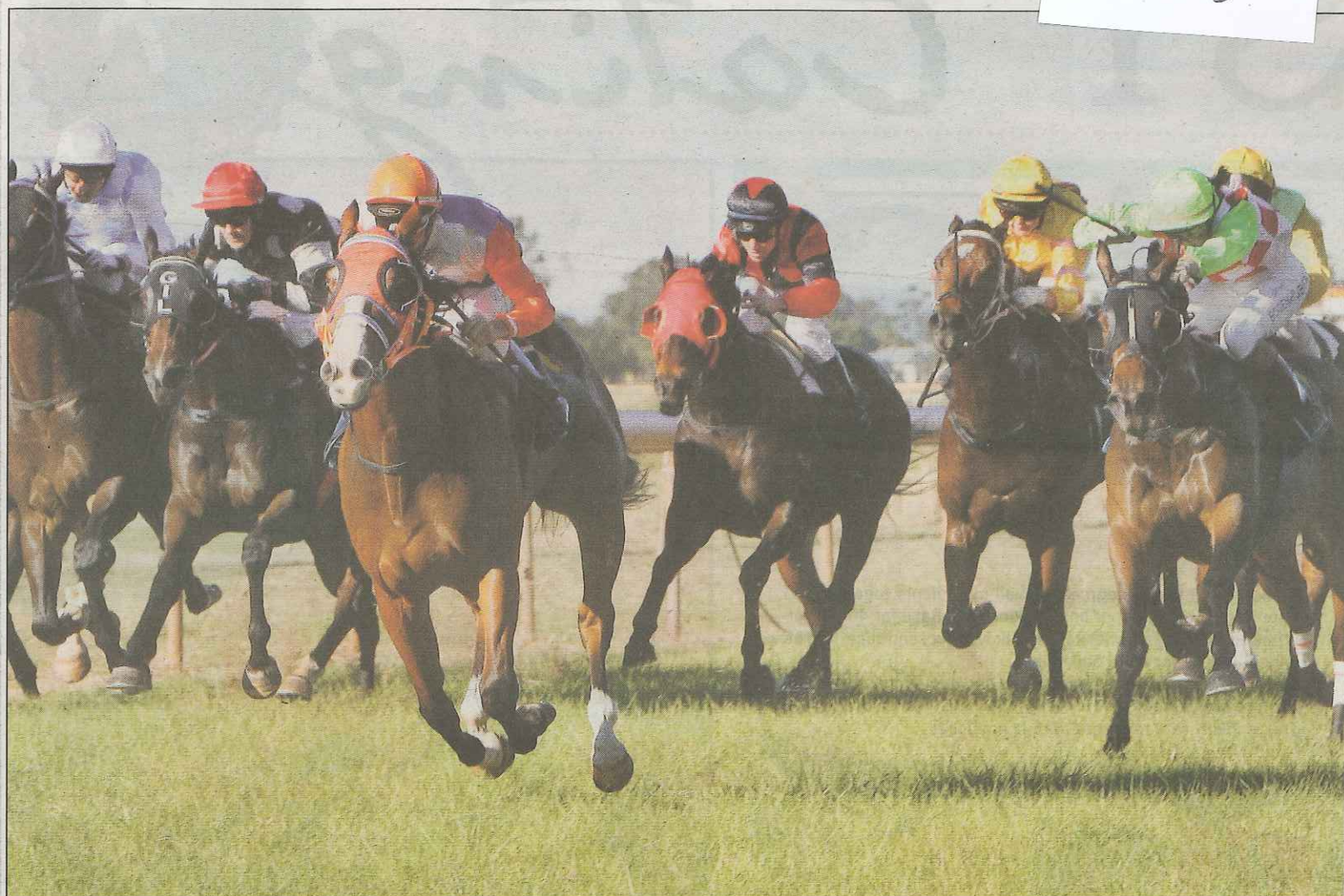
GIDDY UP: The LNP says it will fund extra country race meetings if it wins power at the next state election.