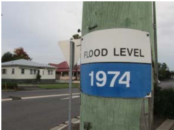
A photo of a flood marker attached to an electricity pole in South Lismore.

It is important to provide sufficient quality information for the broader public. Information that can not be tampered with, information which is readily available and information which is accurate and will assist purchase decisions particularly in relation to locations and the provision of housing.