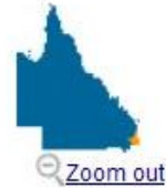
Rainfall forecast for 10/01/2011