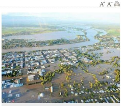
Bundaberg South, 2010 floods.

"The photo I took from the air at 9.06am shows those areas under water," he said.